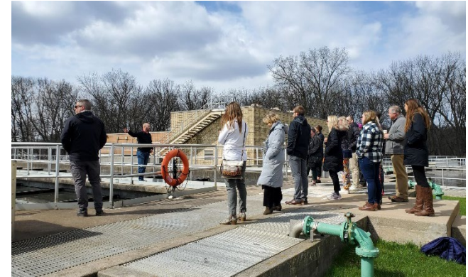
GTLC members touring the Stevens Point Wastewater Treatment Plant at a recent member meeting.

*All Legacy Communities receive networking, learning, and recognition benefits, while communities that complete the Sustainability Strategies Scoresheet each year may also receive additional consideration for select grants and loans.