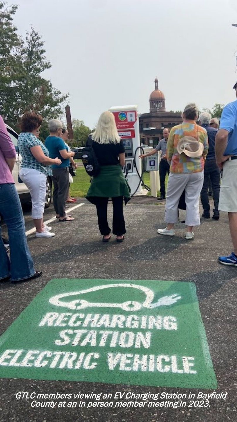
GTLC members viewing an EV Charging Station in Bayfield County at an in person member meeting in 2023.